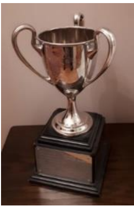
EVERETT DRAKE TROPHY