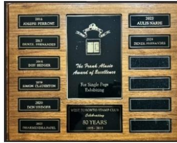
FRANK ALUSIO TROPHY