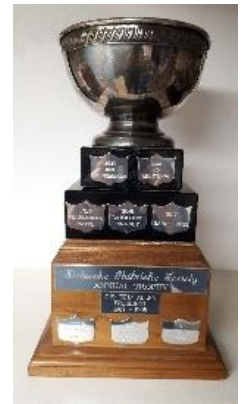
TED ALLEN TROPHY

How will you participate this year? Members are invited to exhibit in one or all of the three exhibit categories: Single Page, Multi-Page or One Frame Exhibit for this year's club exhibition.